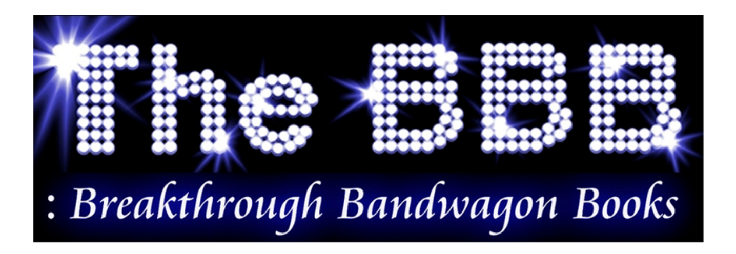
The BBB website http://thebbb.net/