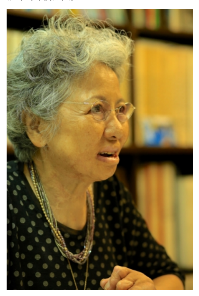
——At that moment, didn't you realize that it was a bomb? Any fear or pain you felt?

The airplane glittering so bright with a beautiful jet stream, I told my classmate 'Look, it's so beautiful' and the next moment, something white fell from it. I was told later that it was a parachute with a bomb. There was a huge bomb blast and I fell on the ground. I was at Hiratsuka city, about 1.5km from the center from which the bomb fell.